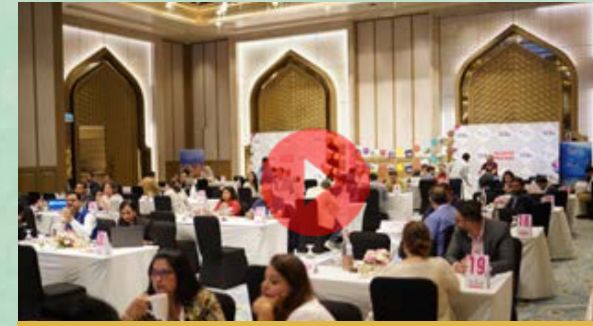
Travel Wedding Show (Part-III)