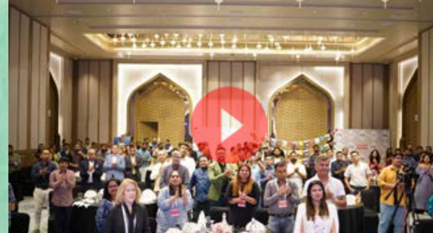
Travel Wedding Show (Part-II)