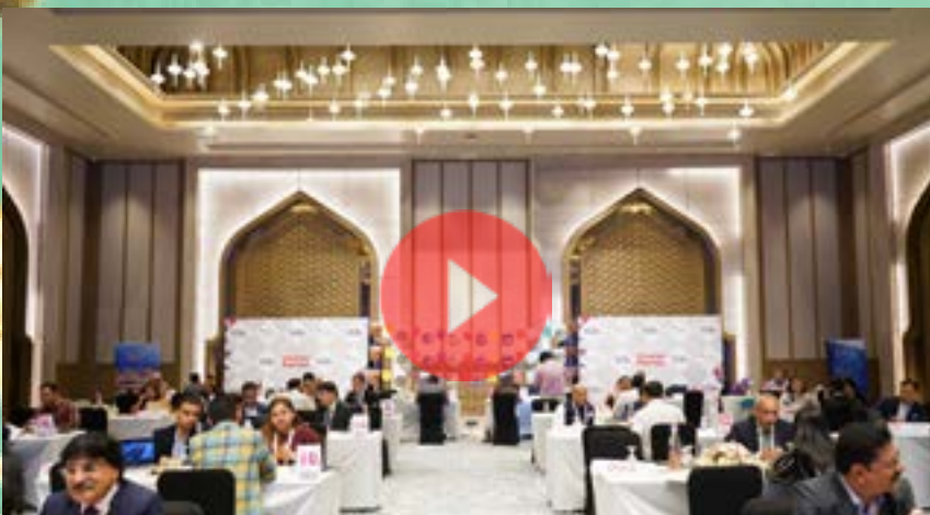
Travel Wedding Show (Part-V)