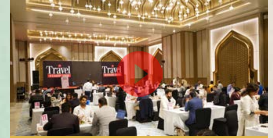
Travel Wedding Show (Part-IV)