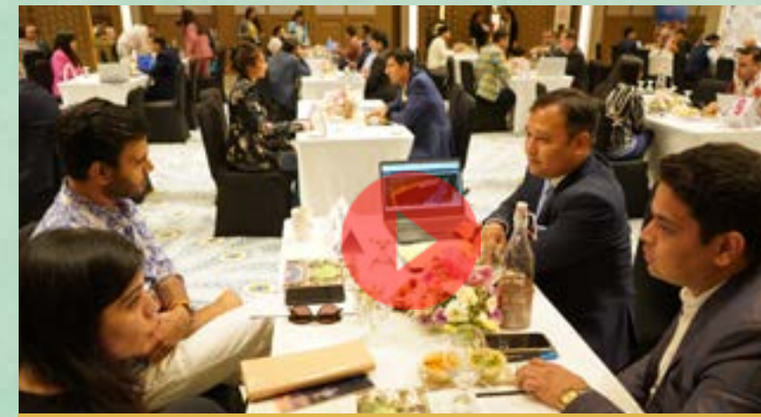
Travel Wedding Show (Part-VII)