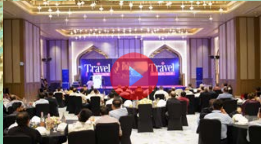
Travel Wedding Show (Part-I)