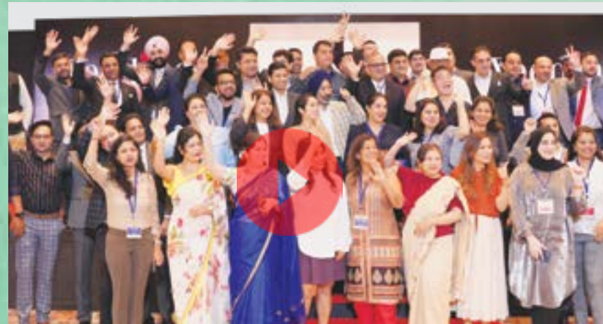
Travel Wedding Show (Part-VI)