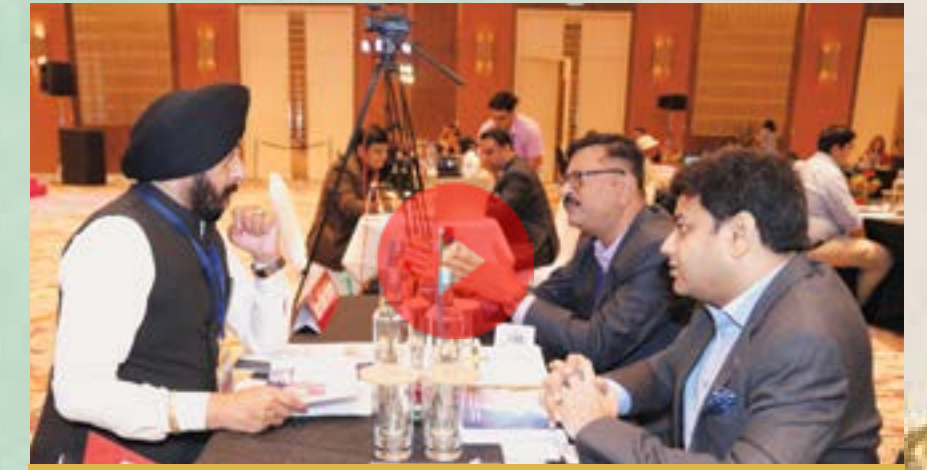
Travel Wedding Show (Concluding Part)