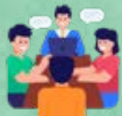
Table-top B2B event